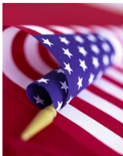
Flag Day—June 14 th !